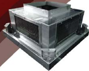
Diffusers PA-Series Supply/Return Diffusers & Drain Pans

Phoenix Air Systems™ can work with your team of experts in each step of the process – from concept and design, proposal, manufacturing and commissioning with outstanding support after the sale. We also offer a standard control system that can be integrated with existing refrigeration controls or process automation systems for enhanced process room environmental control.