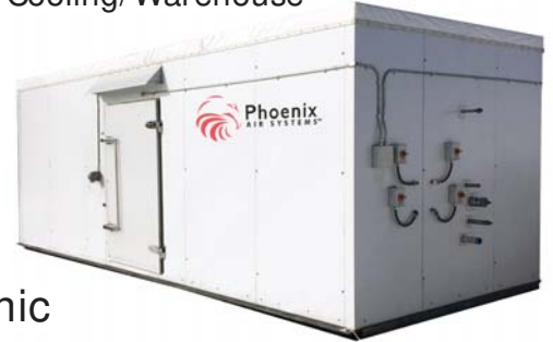
Desiccant Hygienic Air Handlers