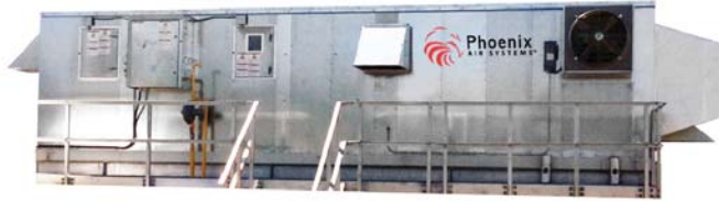
PHD-Series Mixed Air or 100% Make Up Air