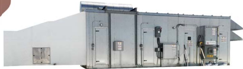
Make Up Air Systems