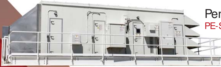
Hygienic Air Handlers PH-Series Mixed Air Systems

Phoenix Air Systems™ is a leading manufacturer of Hygienic Air Handling Systems providing a comprehensive approach for the critical process environment of the food and pharmaceutical grade production and process industries. Our team of experts helps to ensure your building's environment meets your needs. We specialize in production room environmental control for a variety of product types and production requirements.